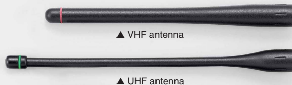
▲ VHF antenna