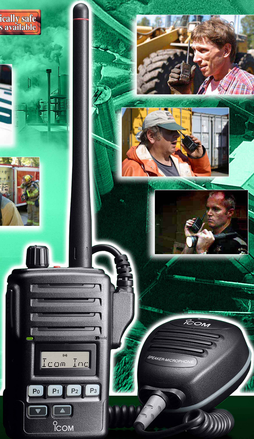
Photo includes optional speaker-microphone, HM-138.